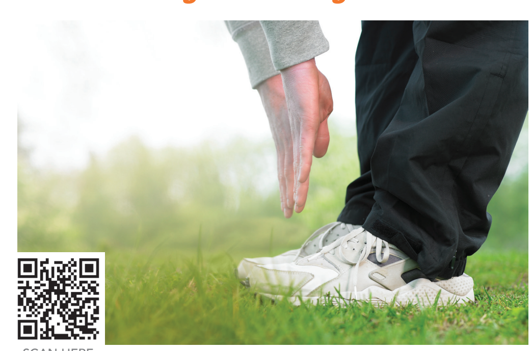
Pain Medication Safety